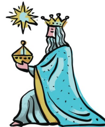
Answer: B (See Matthew 2:1-12.)

Fort Branch First UMC P. O. Box 116 Fort Branch, IN 47648