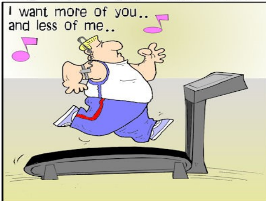
He must become greater, and I must become less. John 3:30